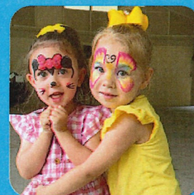
Fun for all ages

Bring your family and friends for this FREE EVENT!