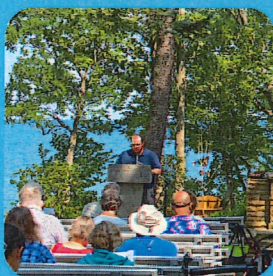
Morning Church Service

We are thrilled to invite you to an amazing day at Pioneer on the Lake, with lake breezes, sunshine, hot dogs/hamburgers, ice cream, bounce houses, face painting, tractor train rides, worship music and so much more! Come, join us for a great FREE day on the lake and be refreshed at Pioneer!