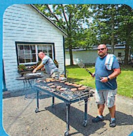
Food, Beverages, and Ice Cream