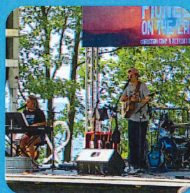
Live Worship Music