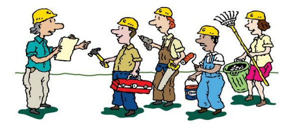
Summer Projects Underway

We are in need of an aide for our 1st & 2nd grade classroom Monday-Friday, from 12:40pm-3:10pm. Please send a letter of interest and/or resume to: principal@thinktrinitychristian.com.