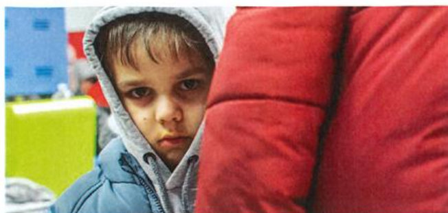
A young boy in the Kraków Główny Main Station after arriving from Ukraine.