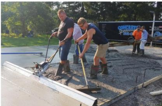
New concrete playground pad!