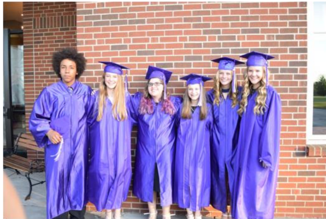
Class of 2018

Next year there will be many more people in our class and it will be easy to stray from our relationship with God. A Bible verse that we should all remember, especially my fellow graduates, is Romans 12:2. It says "And do not be conformed to this world, but be transformed by the renewing of your mind, that you may prove what is that good and acceptable and perfect will of God." I have learned so much from Trinity and made many amazing memories here! Thank you parents and grandparents for driving to sports games, helping with homework, and helping with fundraisers that make the fun activities we do possible. Thank you to all the teachers who made this place so special to me and to my classmates who always challenged me. While I am terribly sad to leave I know I'll be back to visit and I am excited about what high school brings.