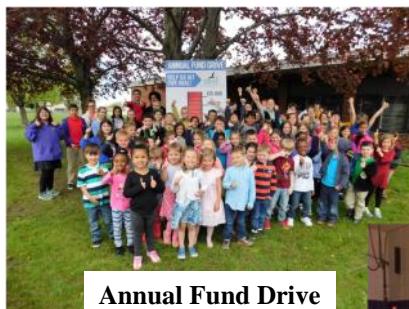
Annual Fund Drive