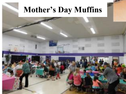
Mother's Day Muffins