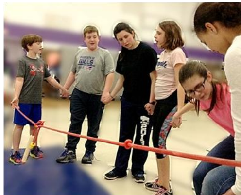
Jr. Youth Team building: get everyone over the rope without touching it!

If you have a student in grades 6-8 and they haven't come to one of our youth nights, it's time to check it out. We have new kids coming every month and ... they keep coming back! Our next one is April 24 held in the school gym from 7:00 -8:30pm.